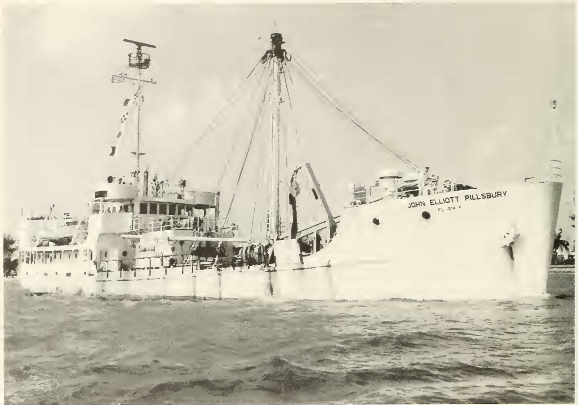
Figure 5. R/V John Elliott Pillsbury about 1965.

numbers of marine animals from the tropical western Atlantic, the Bay of Panama, and the coast of West Africa, including a rich collection of octocorals as well as other invertebrates and fishes. Operations aboard R/V Gerda in 1963 obtained the first records of the precious coral genus Corallium in the tropical western Atlantic, as the new species Corallium vanderbilti reported by Boone (1933) was based upon a specimen of Dodogorgia nodulifera (Hargitt), a species with gross aspect deceptively similar to Corallium but lacking the stony axis characteristic of that genus (Bayer 1964).